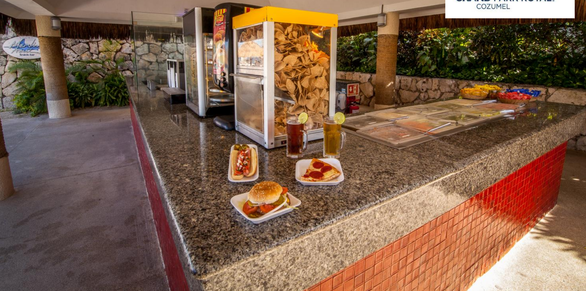
Marlín Azul Snack