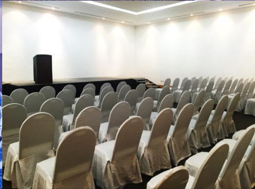
Coventions and Conferences Center