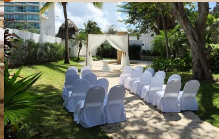
Wedding montages: Lounge, gardens and beach.