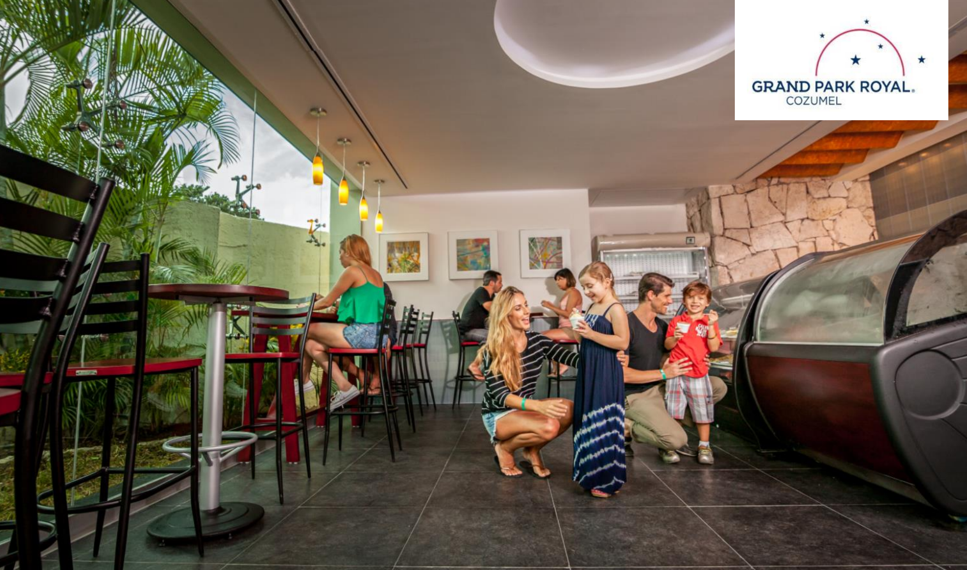
Coffee and Ice Cream Shop